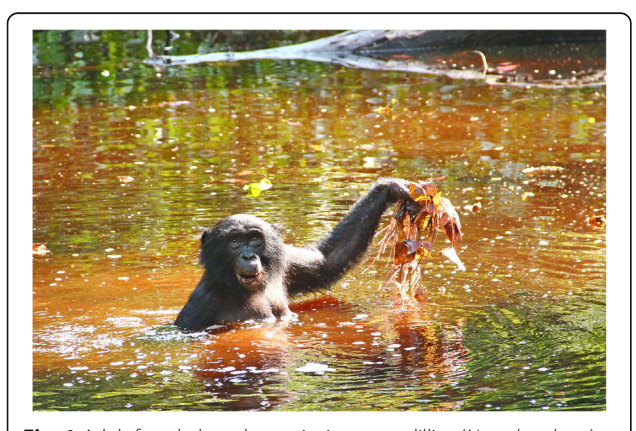
Fig. 1 Adult female bonobo retrieving water lillies ( Nymphea lotus ) from a back water

According to the World Health Organization (WHO) the continental part of the Congo basin is considered to be a region where natural sources of iodine are scarce (WHO Global data base [23]). This classification is based on survey data from human populations that showed a high prevalence of iodine deficiency symptoms and low values of urinary iodine excretion [24]. Introduction of iodized salt has improved the iodine status and reduced the appearance of iodine deficient symptoms amongst village populations [25]. This raises the challenging question of how ancestral human populations were able to meet their iodine requirements in this environment. Unlike many other human populations of the Congo basin, Efe pygmies show a low prevalence